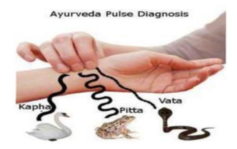
Figure No: II Ayurvedic pulse measurement

the pulse's vibrations along the radial artery may be determined with the use of Naadi Pariksha. Seven unseen layers of vibrations assist identify certain physiological processes when read vertically and below. The state of a person's physical and mental health may be determined by measuring their pulse <sup>[76-78]</sup>.