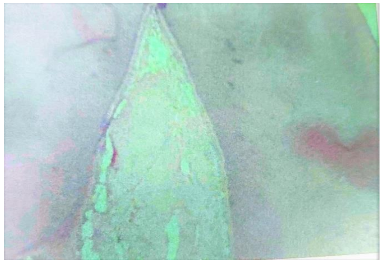
Fig 3 Decalcified section of Incisor in EDTA