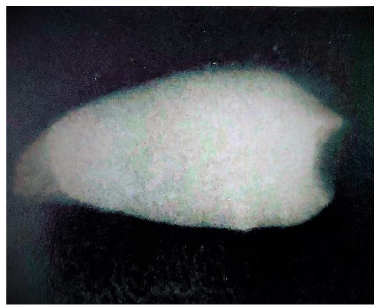
Fig 2 End point of Decalcification of Premolar