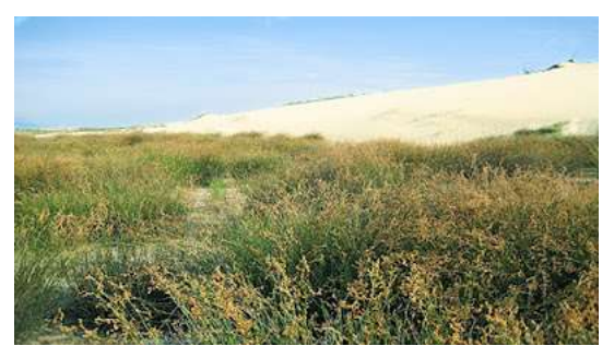
Fig 1. Chanhluong grass in Central Coastal Vietnam