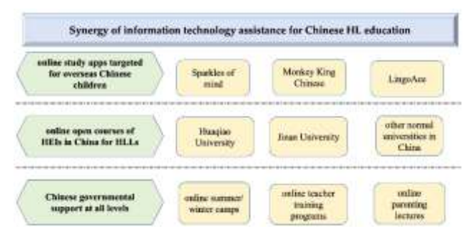
Figure 2. Synergy of information technology assistance for Chinese HL education

education institutions (HEIs) in many colleges and universities, e-textbook development, public courses developed by public media, study aids built by enterprises, and generative resources contributed by netizens. There are three major information-based teaching recourses to assist HL education.