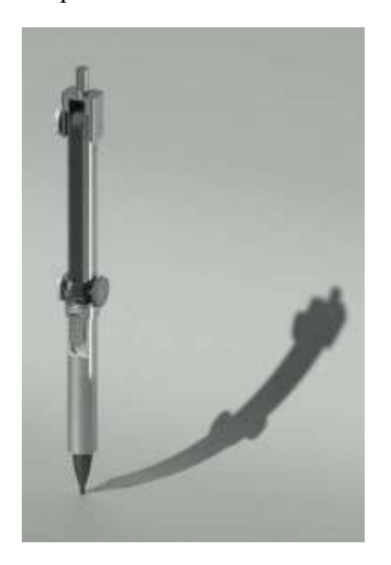
Figure. 1 Pictorial view of COMECH in the design of a Hidden Compass

The product design combined the functionality of a compass and a mechanical pencil, creating a versatile and convenient tool for various tasks. The device featured a sturdy, ergonomic body that incorporated the compass and mechanical pencil components. The compass aspect allowed for precise measurement and drawing of circles and arcs, while the mechanical pencil component enabled accurate and clean markings. The pencil lead could be easily adjusted for different lengths and was housed within the body, ensuring protection and minimizing the risk of breakage. This innovative combination offered efficiency and convenience, making it ideal for artists, designers, architects, and anyone needing compass and pencil functionalities in a single tool.