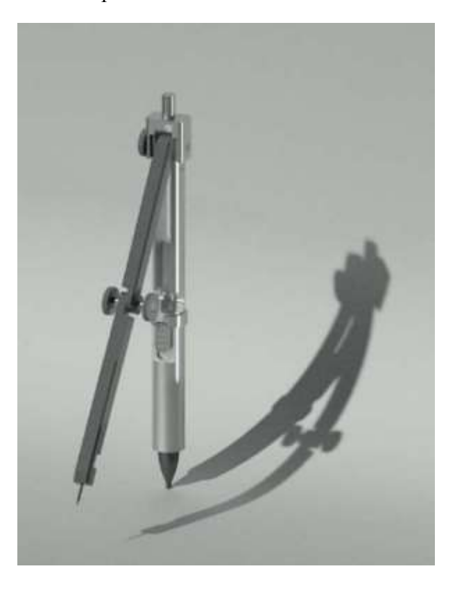
Figure 2. Pictorial view of COMECH in design of an opened Compass

aluminum was also pleasing to the naked eye due to its shiny look. The dimensions of the design were properly chosen to avoid numbness, especially while using the mechanical pencil. The two parts of the compass were made out of engineering plastic, a type of plastic that could not be easily broken and could withstand pressure. The compactness of the design was important to avoid discomfort while using the mechanical pencil.