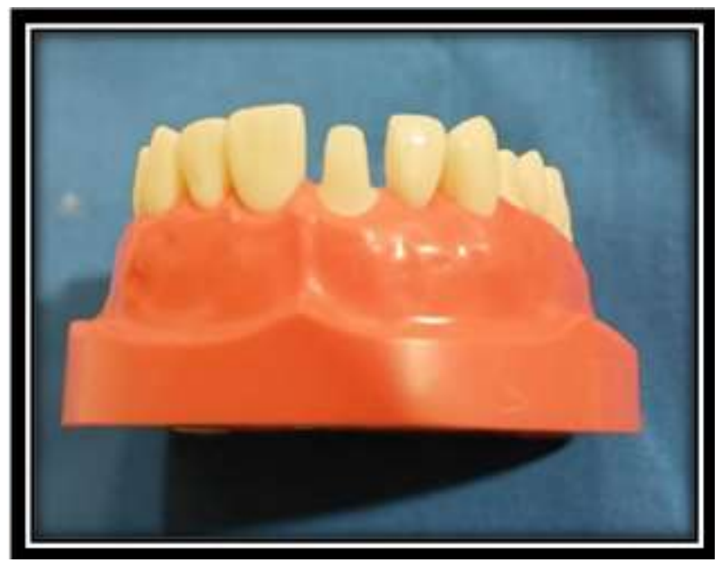
Figure 1: Typodont

silicone impression material after having applied enamel body on to the coping which was of a thickness of 0.2mm at the cervical, middle and incisal. Forth index was made with silicone impression material after having applied glazing material on to the coping which was of a thickness of 0.1mm at all the surfaces of the coping. With this procedure we achieved indexes of layering to maintain the thickness of the layering material.