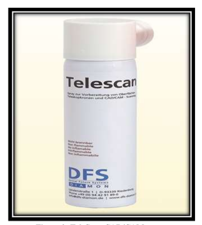
Figure 2: TeleScan CAD/CAM spray