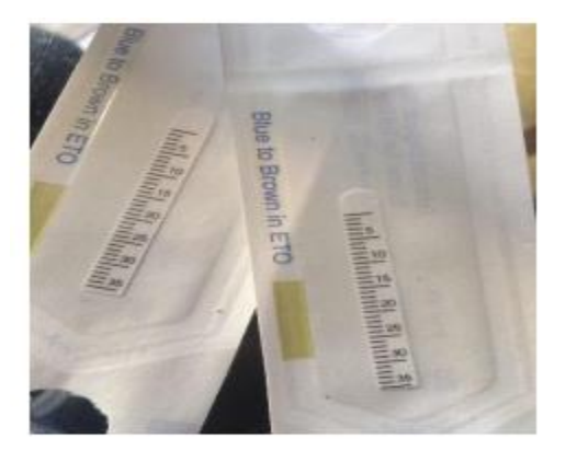
Figure (2): Schirmer strips. <sup>(12)</sup>

on the filter paper was calculated. A tear film thickness of less than 10 mm was considered dry. We noted the typical Schirmer test results for the left and right eyes.