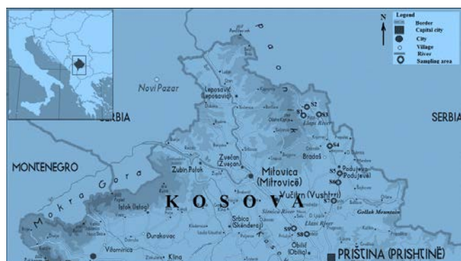
Figure 1. Study area with sampling stations.

The Llap is a river in the north-eastern part of Kosovo and the 82.7 km long right tributary to the Sitnica river, 16 which runs through the middle of Podujevo. The source of Llapi river is considered to be the Pollata village in the Albanik Mt., where the rivers of Murgulla and Sllatina are joined. This river is wide from 9 to 12 meters and deep up to 1.2 meters. The river brings an average of 4.9 \text{ m}^3 \text{ s}^{-1} , however, there are considerable variations with the maximum going up to 25 \text{ m}^3 \text{ s}^{-1} . The Llapi river originates from Albaniku Mountain in the Prishtina region. Near the village of Stanovci i Poshtëm, the Llapi river splits and empties into the Sitnica river. The sampling process of river water was performed on August 12, 2015, to cover the river spatially, taking into account anthropogenic pressures, the different habitats, and the hydro morphological conditions of the river.