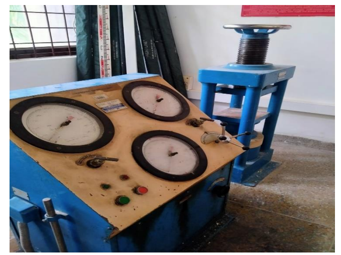
Figure 2 compressive testing machine

To find out the basic quality of the concrete cubes, casted utilizing EPS beads in concrete and Compressive strength test was conducted at the conclusion of 7 and 28 days curing period utilizing compressive testing machine , capacity 2000 kN. The comes about gotten are.