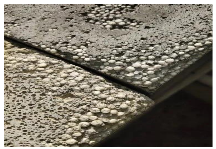
Figure 1. EPS Beads

Lightweight concrete keeps up its huge voids and doesn't shape laitance layers or cement pictures when put on the separator. This disquisition was predicated on the prosecution of circulated air through light concrete. In any case, acceptable water cement proportion is imperative to produce satisfactory cohesion between cement and water. shy water can beget need of cohesion between patches, hence mischance in quality of concrete. also, as well important water can beget cement to run off total to make laitance layers, hence debilitates in quality. Hence, this pivotal disquisition report is ready to appear exercises and advance of the light concrete. Centered were on the prosecution of circulated air through lightweight EPS beads concrete similar as compressive quality tests, water assimilation and consistence and supplementary tests and comparisons made with other feathers of light concrete. Figure 1 show the EPS beads.