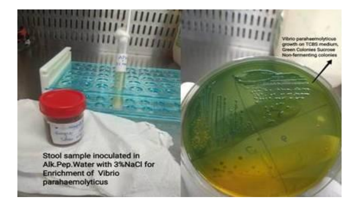
Figure 1: Confirmation of V.parahaemolyticus