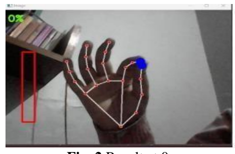
Fig. 2 Result at 0 perc.

The described result highlights the outputs obtained when using the program with image or video input captured by the camera. Image processing involves detecting landmarks and preprocessing them to control the volume. The program applies image processing techniques to extract and figure out the relevant information by examining the input data, such as the position of the hand and movement of the user's hand or fingers.