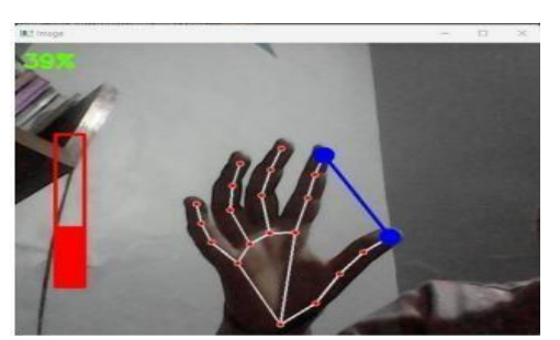
Fig. 3 Result at 39 perc.