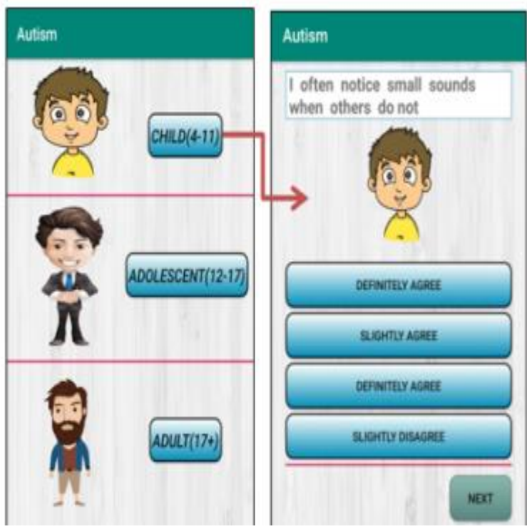
Figure 1. Mobile App implementaion

It was launched using AWS WITH Application Programmable Interface (API) for easier user of mobile users.