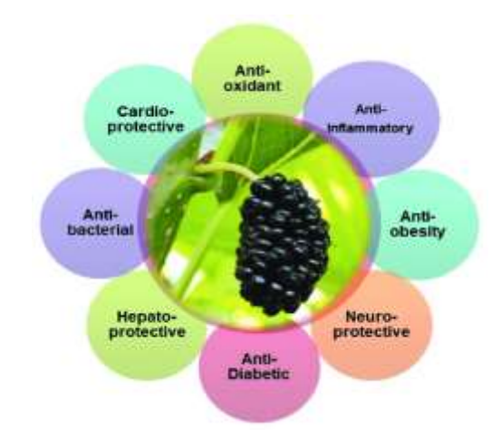
Figure 1: Mulberry Benefit[4]

Cardiometabolic risk factors refer to a group circumstances that raise the chance of becoming type two diabetes or cardiovascular disease. These risk factors often coexist and interact with each other to increase the likelihood of developing these chronic diseases[2]. There are several health conditions that are associated with an unhealthy lifestyle. One of them is obesity or being overweight, which is characterized by having a BMI of 30 or greater. Another condition is high blood pressure or hypertension, which is a common condition that can harm arteries & rise the risk of developing cardiovascular disease. High levels of blood sugar or hyperglycemia can also lead to complications such as kidney disease, vision loss, and cardiovascular disease, and it happens at place where the body is unable to use or produce insulin rightly. Hyperlipidemia, or high levels of blood cholesterol, particularly LDL cholesterol, can cause plaque buildup in the arteries, raising the cardiovascular problem and stroke risk. Lastly, insulin resistance occurs when cells stop the work insulin to properly, leading to high blood sugar and eventually type two diabetes. It is often connected with obesity and physical inactivity[3].