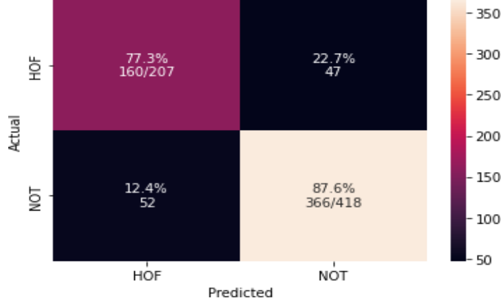
Figure 5: Confusion matrix of Marathi subtask A - MBERT

English subtask A and English subtask B. For future work, we will handle the sarcastic feature and imbalanced dataset to avoid misclassification and extend this work into other low-resource languages.