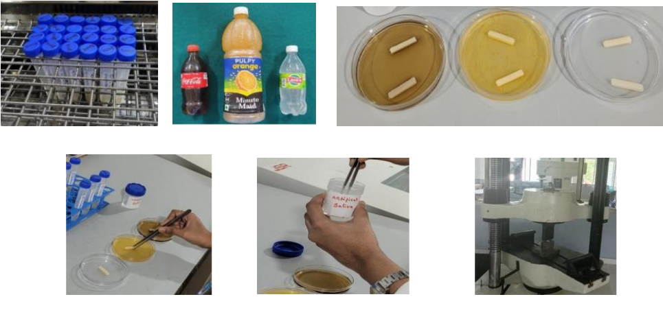
Fig. 1 Stepwise study intervention