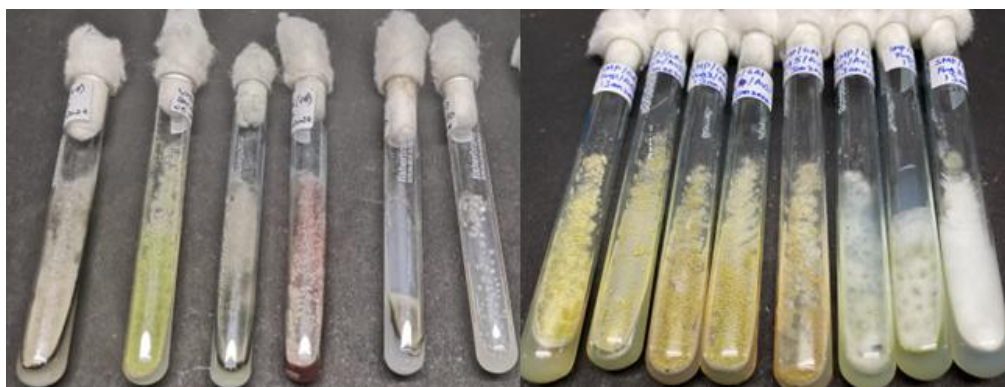
Figure 1 Pure cultures of Endophytic fungi isolated from green and brown marine algae

Pikovskayas agar is used to screen phosphate-stabilizing organisms. The isolates were loaded in a well and incubated at 35-37 °C for 48 hours. The isolates which have solubilizing potential will produce clear zone around colonies.