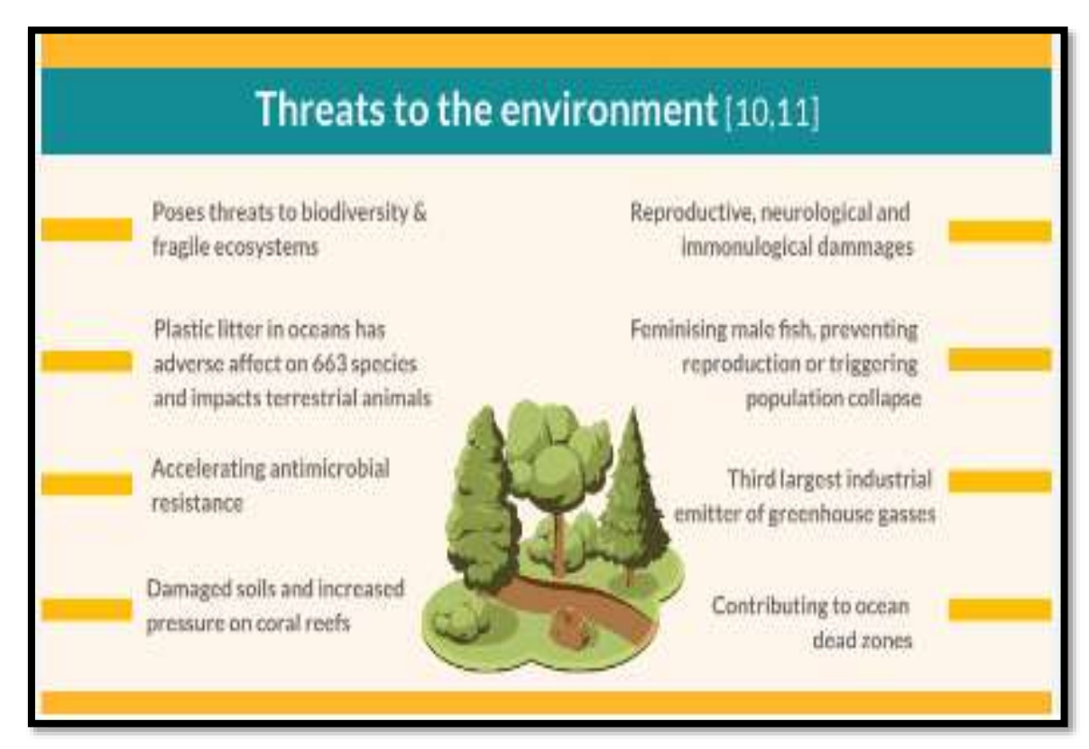
Figure 3: Threats to the environment