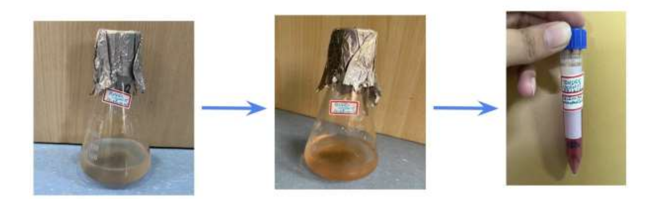
Figure 1 : Preparation of Selenium nanoparticle using Cocos nucifera water : 50ml of Cocos nucifera water and sodium selenite + ascorbate mixture were added together in a beaker (a). Following progressive stages of color changes (b), final meron coloured selenium nanoparticles were evidenced (c)which is taken as the final step of synthesis.