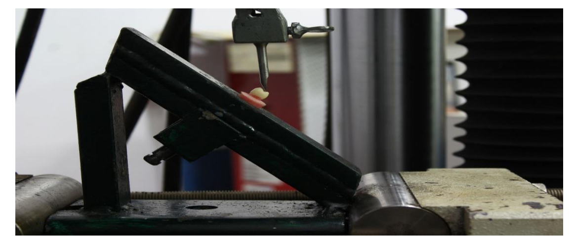
A picture illustrating the application of inclined forces at a 45-degree angle on a sample using the Universal Test Machine.