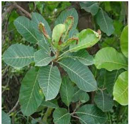
Figure 1:Seme Carpus Anacardium Seed