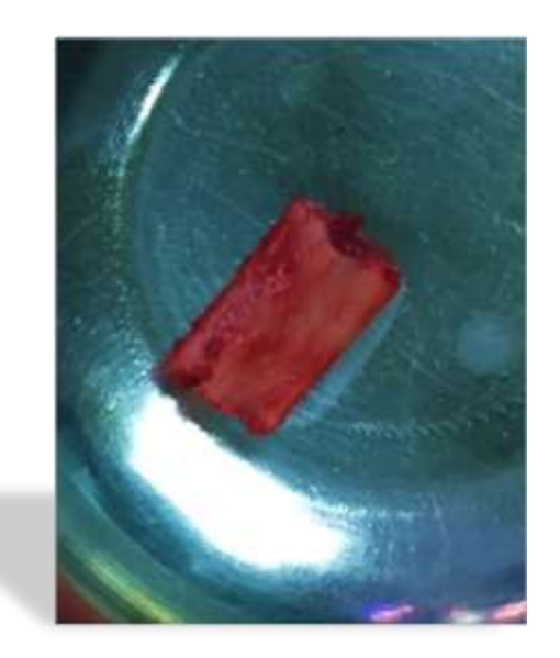
Figure 1: Fibular osteotomy.