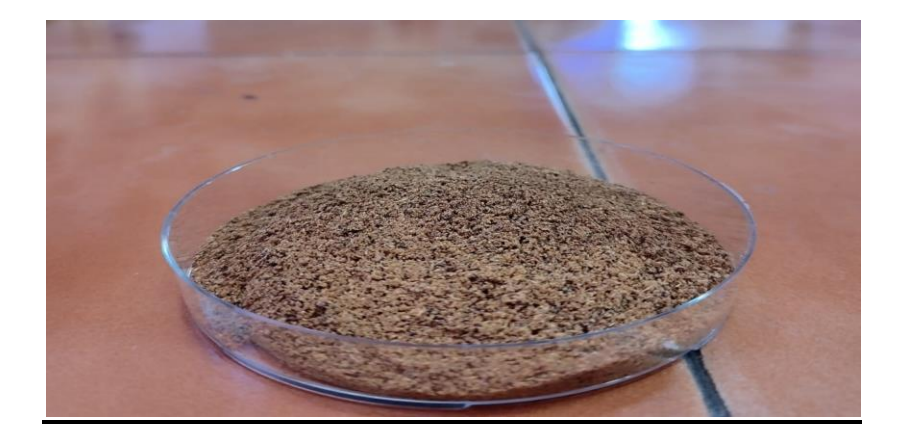
Figure 1: Physically pretreated fruit pulp biomass

Physical pretreatment increases the surface area and also decreases the degree of polymerization and crystallinity by reducing the particle size. It reduces the reaction time and energy consumption by significantly increasing the surface area. The physical methods are environmentally friendly and less toxic.