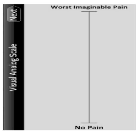
Figure 3: the Panda version of the visual analogue scale (VAS-100)