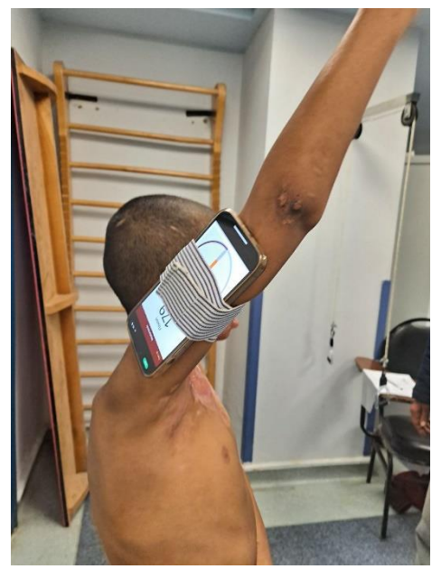
Figure 1. Measurements of forward flexion,