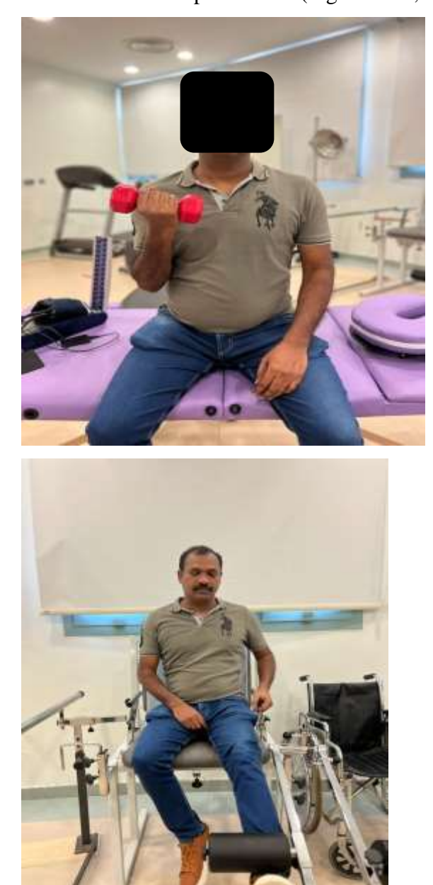
Figure 4. Shows lightweight resistance exercise for upper limb (a) and lower limb (b). Aerobic training was carried out using a treadmill, keeping zero elevation (0^0) and training intensity at 70% of the maximum heart rate for ten-minute per session.<sup>[24]</sup>

It starts after the warm-up phase. It exhibits light-weight resistance exercises and aerobic training on a treadmill for a total duration of 20 minutes. A lightweight resistance exercise was carried out using 1/2kg weight cuffs for the upper and lower limbs, with ten repetitions of each movement per session (Figures 4. a, b.).<sup>[23]</sup>