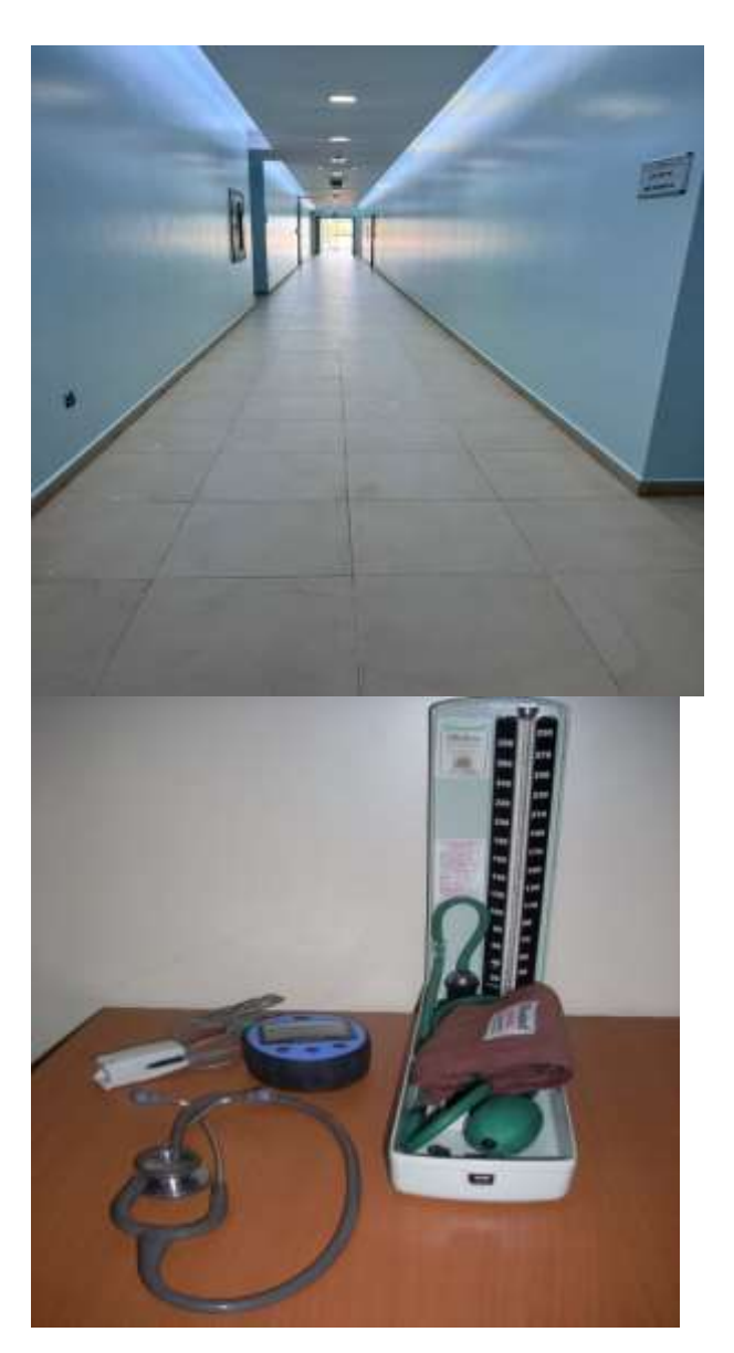
Figure 1. Shows a free lane for a six-minute walk test (a) for assessing exercise capacity; and a sphygmomanometer, stethoscope, and pulse oximeter (b) for measuring systolic and diastolic blood pressure, heart rate, and oxygen saturation, respectively.