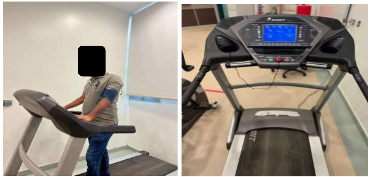
Figure 5. Shows participants performing aerobic training on a treadmill (a) at zerodegree elevation (b).