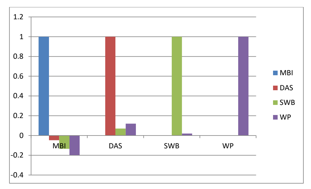
GRAPH 3. Coefficient of Co-Relation between the variables

From the above table we could find that the result of coefficient of correlation values, suggest that the there is negative relationship or there is no any effect of burnout with Subjective well being as well as with work performance of Govt and Private nurses. But, there was a significant effect of Depression, Anxiety and stress on subjective well being more and work performance mildly on both the male and female genders of nurses.