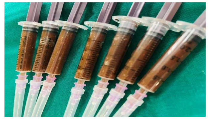
MIMUSOPS ELENGI GEL