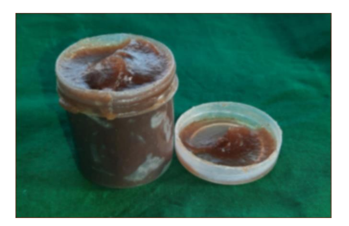
MIMUSOPS ELENGI (BAKUL) EXTRACT

Subjects were asked to use gel, which they received, two times a day (each time for two minutes) for two weeks. Clinical parameters such as Gingival Index (GI) and gingival bleeding index(GBI) were evaluated at baseline and after 14 days.