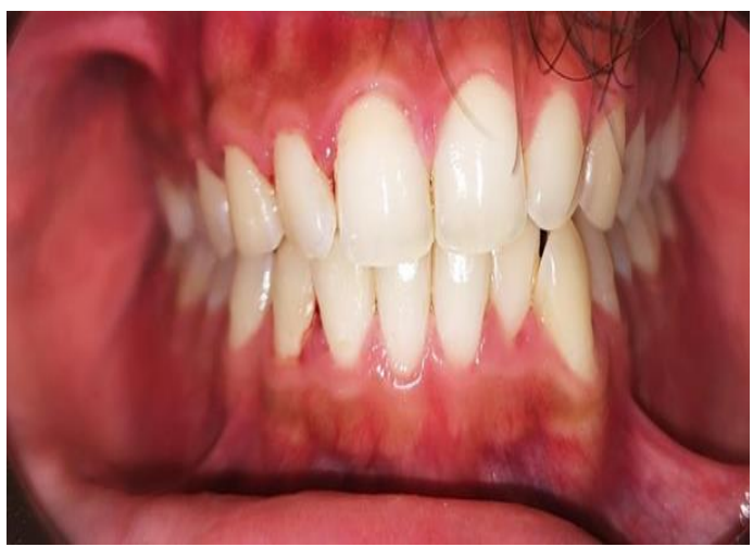
BEFORE AND AFTER APPLICATION OF CHLORHEXIDINE GEL (PRE-OP AND POST-OP)