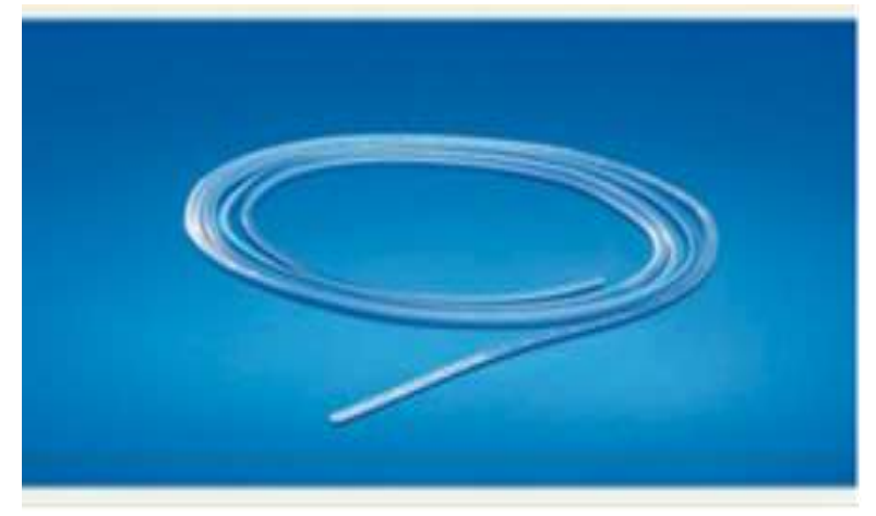
Figure(1 e) tube drain open (27).