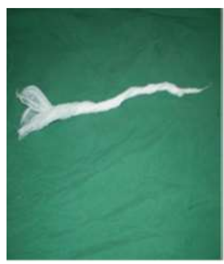
Fig (1 g)close tube (27).