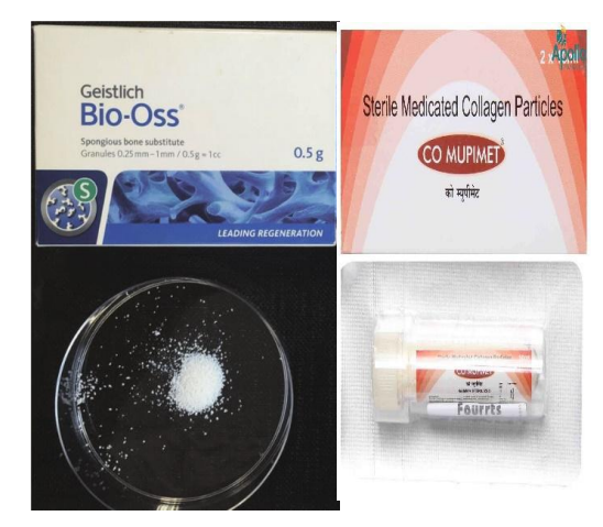
Fig 4: Bio Oss & Co Mupimet