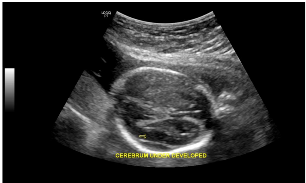
Figure 2:-Transabdominal sonography of fetal skull showing under developed skull.