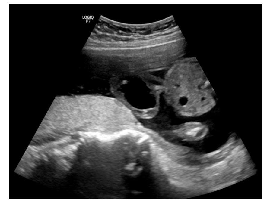
Figure 1a. Transabdomoinal ultrasonography gray scale imaging shows Umbilical cord cyst near the fetal insertion site. 1b. on putting colour Doppler we can see umbilical vessels around the cyst.

149/min) was imaged at 7 weeks of menstrual age. Next scan was performed at 13^{\text{th}} week for nuchal translucency (NT ~ 1.4mm) and fetal anatomical anomalies at 20^{\text{th}} week of gestation was performed. At targeted imaging for fetal anomalies scan ( TIFFA) an umbilical cord cyst (figure 1 a& 1b) measuring ~ 3.2 x 2.2 cm was seen near to the cord insertion site (0.84 cm away from the fetal end of cord insertion site). A few other anomalies imaged with the umbilical cord cyst are underdeveloped cerebrum (figure 2), echogenic foci in both ventricles (figure3), bilateral enlarged kidneys and polydactyly of right feet.