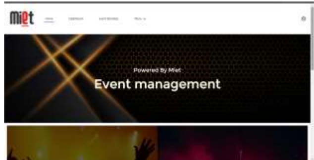
Figure 7: User Interface using CMS

Content management system helps in building a user interface with the help of which the user or the attendee will be able to register them selves through a rich UI.