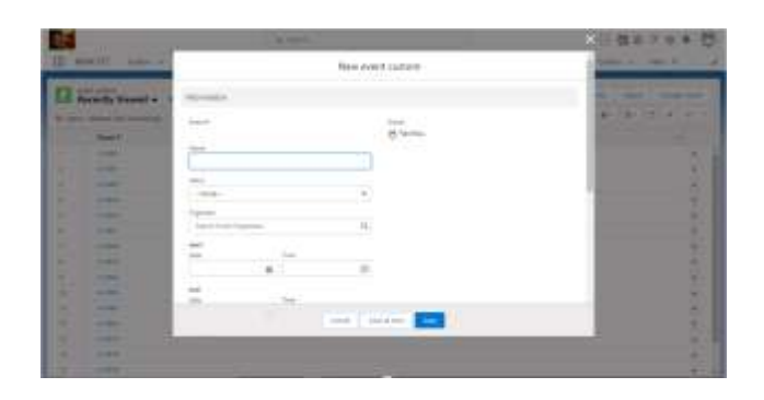
Figure 3: Diagram Depicting One Of The Example Of Custom Fields