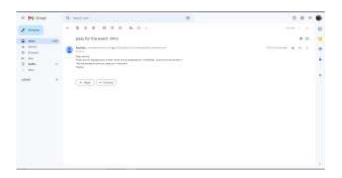
Figure 5:E-mail Alert Using Automation Tool