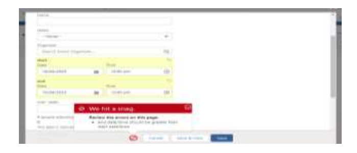
Figure 4:Example of validation rule