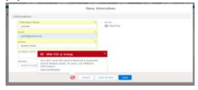
Figure 5:Example of duplicate rule