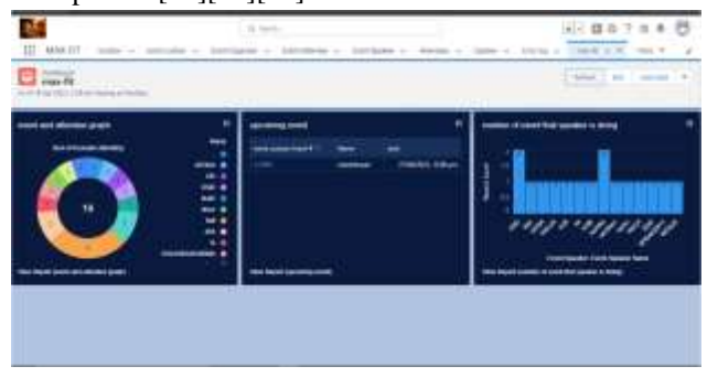
Figure 6:Example of Dashboard