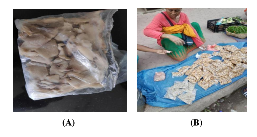
Figure 2: (A) Packed Soidon from Manipur market. (B) Women vendor selling Soidon in Ima Keithel market.

Tamang and Tamang, 2009). For enhancing the flavour of soidon, leaves of Garcinia pedunculata Roxb . (heibung) is added. After initial fermentation, the fermented product is removed which can be stored in an airtight container for a year at room temperature. Washed rice water (Chinghii) is often added to improve the colour and quality of the soidon. The liquid formed during fermentation (soijim) is used as a flavor enhancer or condiment in curry of Manipuri dishes. Soidon is consumed as pickle or curry by the manipuris (Soibam and Ayam, 2018).