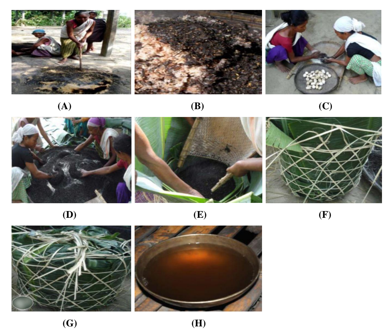
Figure 4: Preparation of sai mod. (A) Straw and rice husk used to prepare ash. (B) Ash mixed with cooked rice. (C) Crushing of starter yeast cakes. (D) Crushed Starter cakes mixed with cooked rice. (E) and (F) Mixture nicely put into bamboo basket wrapped in banana leaves. (G) Mixture left for fermentation. (H) Final product sai mod or poro (Pawe, Dimbo and Gogoi 2013).

mass called poro arouk is a black, wet solid and rough reduced in volume (Pawe, Dimbo and Gogoi 2013).