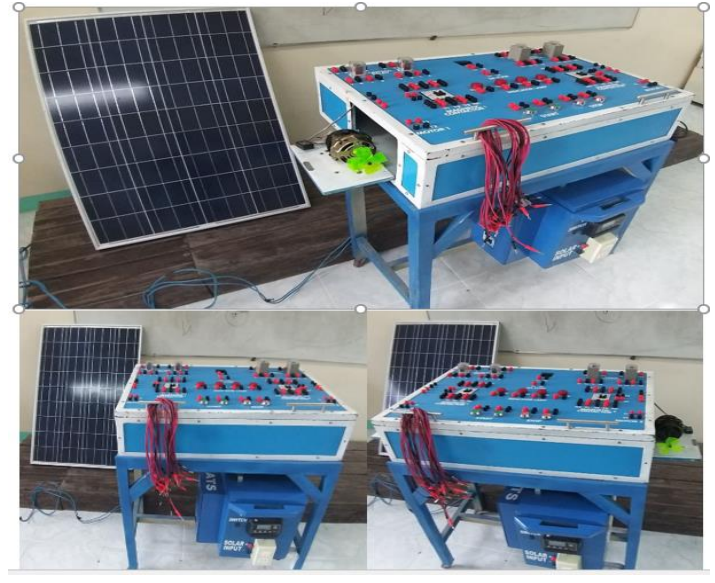
Figure 3. shows the actual picture of the Developed AC/DC Motor Control Trainer with Uninterruptible Power