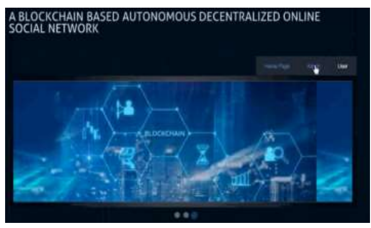
Fig 6.1. Home page

access it. Once the user has created their identity, they can log in to the service.