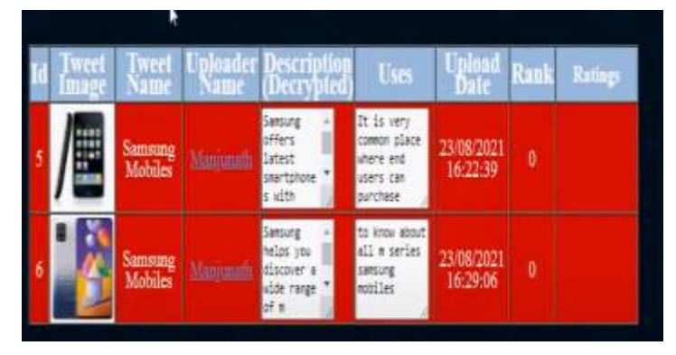
Fig 6.6: Description of product