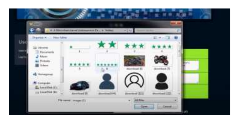
Fig 6.5. Uploaded a figure