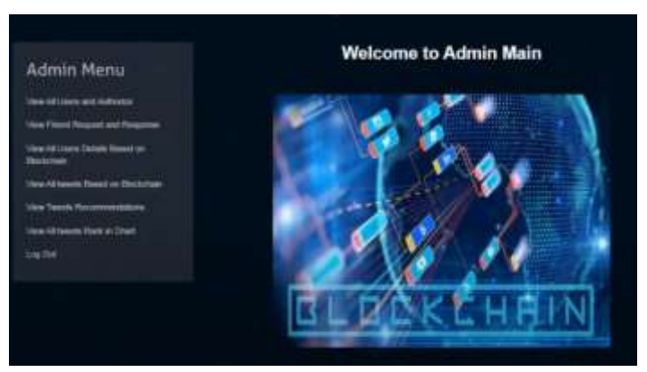
Fig 6.3: Admin main page