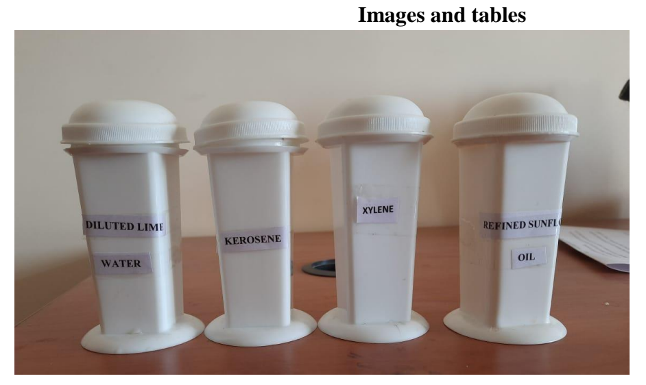
Fig 1 – Groups (Different Deparafinizing agents)

Based on the findings of our study, we infer that 95% diluted lime water, refined sunflower oil and Kerosene can be employed as an alternative to xylene in deparaffinization. Apart from being technically efficient properties like eco-friendly, non-hazardous, economical, reduced time consumption, ease of handling and disposal cannot be neglected. Further studies with large sample sizes are to be done to validate these findings.