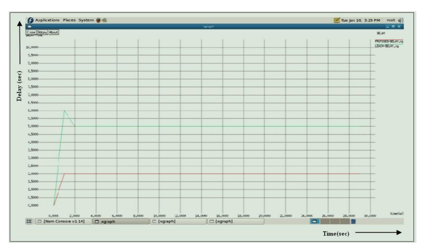
Figure 3: Time Vs Delay plot of LBRD-WSN and MRVCHF- WCSN in NS-2 Environment