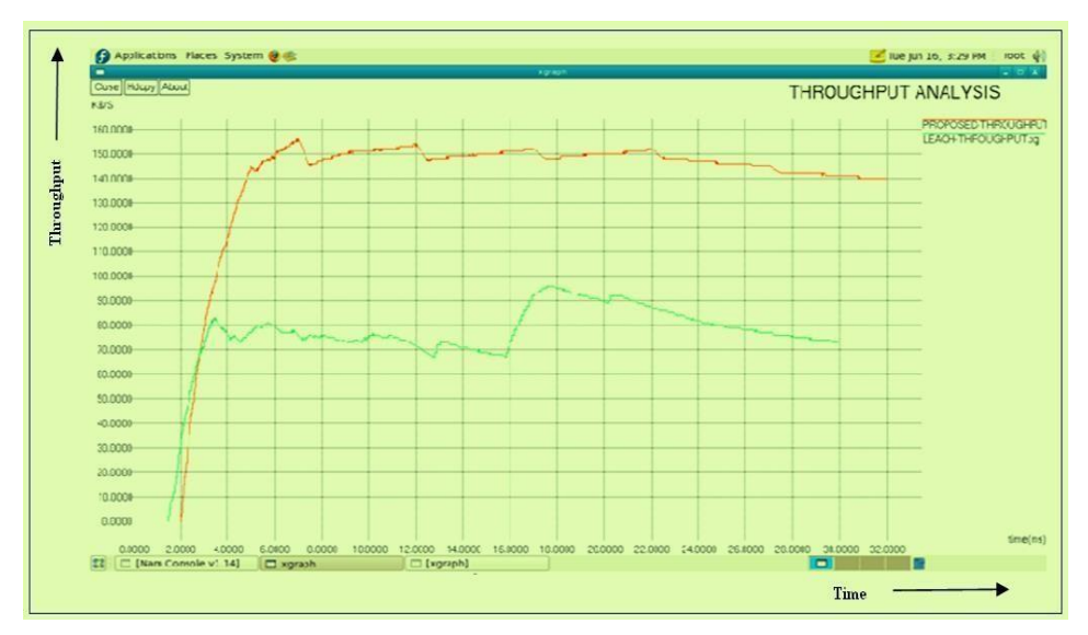
Figure 4: Time Vs Throughput plot of LBRD-WSN and MRVCHF-WCSN in NS-2 Environment