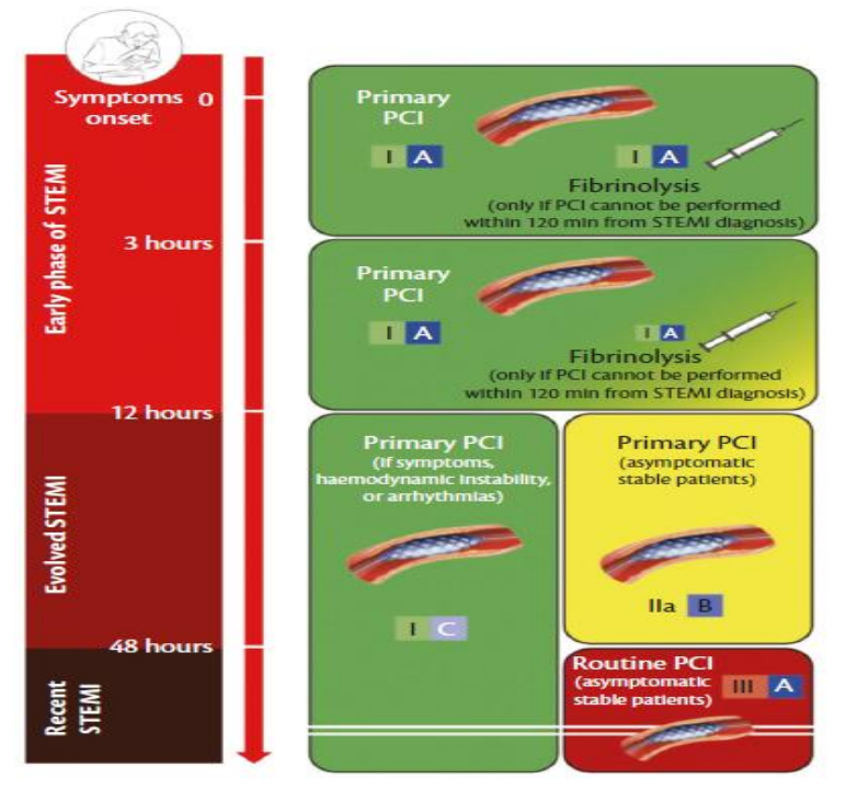
Figure (1): Reperfusion strategies in IRA according to the time from symptom onset. In early presenters (i.e. those with STEMI diagnosis within 3 hours of symptom onset), a primary PCI

ECG = electrocardiogram; EMS = emergency medical system; FMC = first medical contact; IRA = infarct-related artery; PCI = percutaneous coronary intervention; STEMI = ST-segment elevation myocardial infarction.