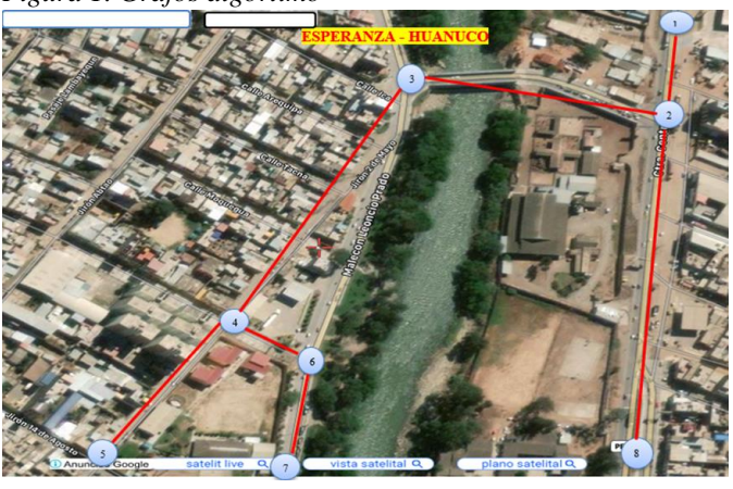
Figura 1. Grafos algortimo