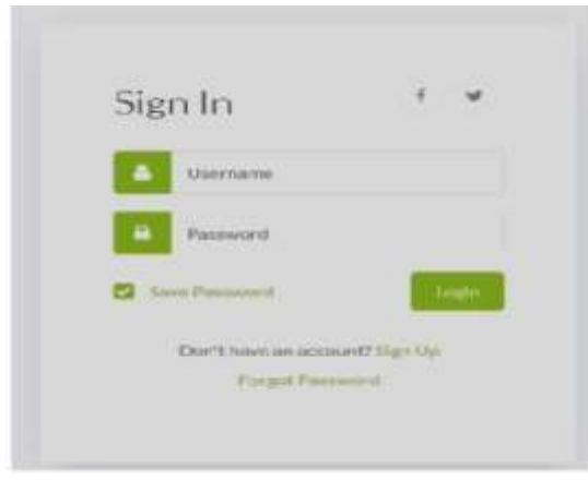
Fig 4. Expert team module

Expert Team Module : The facts, details and precise knowledge of the updated prices, market value understanding will be provided in this modules as they were analyzed by experts. This module benefits the local farmers in understanding the genuine prices of their products in the markets and this will also avoids their undue exploitation by the middle men or mandi dealers [29][30].