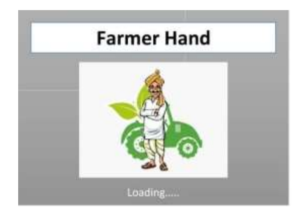
Fig 2. Main Page

Main Page: The default or first page of the database is based on proposed study title i.e., "Farmer Buddy". This will be easily recognized by the agronomists that they are accessing a farmer based application [25][26].