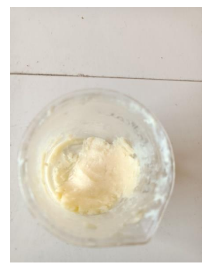
Fig 1. Formulated cream

75^{\circ} C.After heating, the oil phase was gradually added to the aqueous phase while being continuously stirred to create a homogeneous cream. Essential oils were added after complete emulsification when the temperature dropped to 55^{\circ} C to 60^{\circ} C<sup>9</sup>.