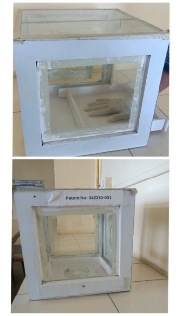
Fig 2. Evaluation of mosquito repellent activity

Method employs a glass-frame cage with a wooden bottom, screened top and back, clear acrylic sides (for viewing), and a front for access. Mosquitoes are placed in the cage before the test. The treated hand is inserted into the cage (a glove is used to protect the hand from mosquito bites.) and the number of mosquitoes repells is observed for 10 min and recorded <sup>9</sup>.