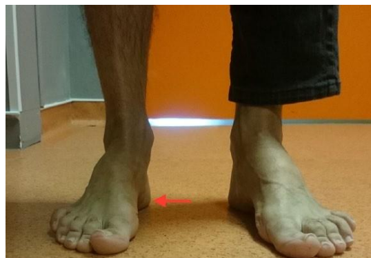
Fig. 3 Right 'peek-a-boo' heel is considered a sign of excessive heel varus (arrow).

Hindfoot varus is confirmed through the 'peek-a-boo' heel sign, which is the clinical condition whereby the heel is visible on the medial side when viewing the patient from the front with the feet in neutral rotation (Fig. 3).