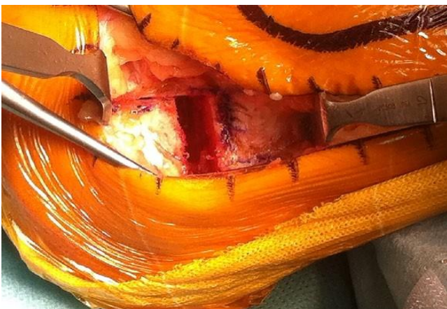
Fig. 7 Operative view showing a lateral bone wedge osteotomy described by Malerba and DiMarchi.

The Coleman 'block test' and hindfoot alignment view are useful to assess the need for corrective hindfoot surgery. When the hindfoot varus is reducible and forefoot-driven, a valgus calcaneal osteotomy is not required. Conversely, if the hindfoot varus is flexible or if there is residual varus after midfoot surgery, a calcaneal osteotomy must be considered. In case of any doubt, an overcorrection is better than an undercorrection [18].