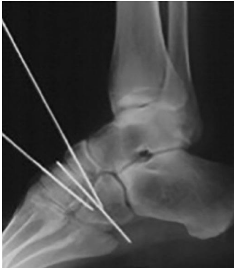
Fig. 5 Fluoroscopic control with pins before midfoot dorsal wedge osteotomy according to Cole's procedure