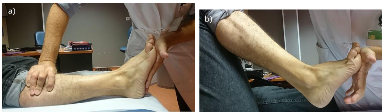
Fig. 4 a and b) Silfverskiöld test to assess the presence of an isolated gastrocnemius tightness.

To assess the presence of an isolated gastrocnemius tightness, the Silfverskiöld test is performed by comparing the range of ankle dorsiflexion with the knee in flexion and in extension (Fig. 4). [6] Knee flexion relaxes the gastrocnemius but leaves soleus tension unaffected and a large range of dorsiflexion with the knee flexed means isolated gastrocnemius tightness. Without improvement of ankle dorsiflexion with the knee flexed at 90°, gastrocnemius contracture is diagnosed. This aspect should be addressed at the time of surgery. At the end of this clinical investigation, we must separate subtle and severe cavus feet. [7]