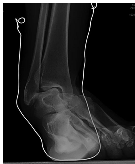
Fig. 2 Anteroposterior weight-bearing view demonstrating tilted talus and medial ankle

Stress views are a useful adjunct in radiographic evaluation to address tibio-talar instability and approach for the reducibility of this talar tilt.