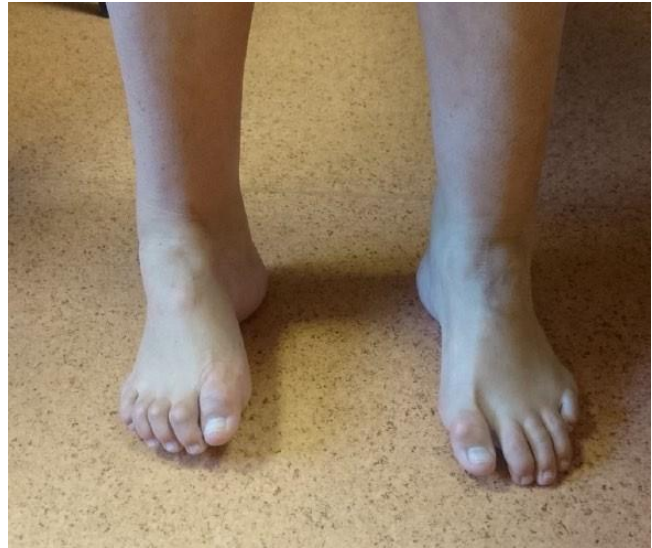
Fig. 6 Post-operative result after surgical correction of a left cavovarus deformity following midfoot osteotomy. Note the significant deformity of the left uncorrected side.

Various other types of osteotomy may be considered. Wilcox and Weiner [17] proposed intra- cuneiform osteotomy and other authors considered tarso- metatarsal resection or metatarsal osteotomy but these procedures do not allow greater corrections to be made. These metatarsal osteotomies lie distal to the apex of the cavus deformity leaving a residual dorsal bony prominence proximally in addition to an inadequate correction of the frontal plane deformity.