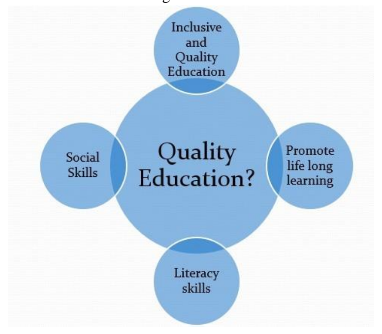
Figure 1: Education Quality

The distinct and consistent demarcation of sociological skills has a fundamental bearing on sociology teaching and learning processes because it corresponds to the legitimacy of sociology in each unique institutional environment. About sociology as training in particular, it is crucial to specify, in what can be a challenging consensus, what is intended to be promoted with the teaching of sociology in each unique institutional environment. Information and communication technology is skillfully used to adapt academic courses and curricula to create a student-centred environment. To help students understand and access new teaching methods, teachers teach students how to make the most of information and communication technology. Information and communication technology (ICT) is rapidly becoming a necessary part of the educational process. Many aspects of an individual's life are affected. These changes have forced academic institutions, administrators, and teachers to reassess attitudes, teaching strategies, and future prospects. New barriers to access have emerged.