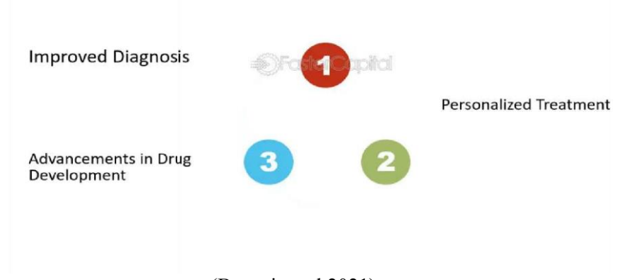
Figure: PPIPLA and Medical Imaging: Advancements in Diagnostics and Treatment How PPIPLA is Revolutionizing Diagnostics

Advanced advancements have changed the nature of treatment and pharmaceuticals. Propels in non-invasive advances such as MRI and CT channels empower early and more precise conclusions. Besides, the AI-powered introduction gadget is modern in analyzing therapeutic pictures and special plans portraying diverse conditions. Utilizing machine learning, these devices can help experts make more educated treatment choices and eventually achieve way better outcomes (In-Mohammed et. al 2021).