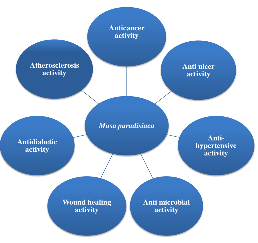
Figure 2. Different Pharmacological activity of Musa paradisiacal

of LDL was improved[44]. Bananas may have this impact because they contain dopamine,