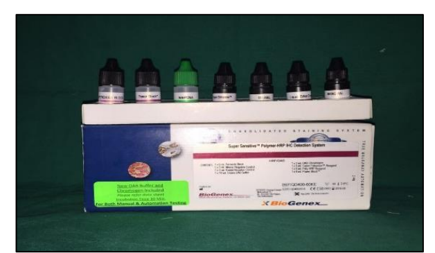
PHOTOGRAPH. SUPER SENSITIVE POLY MER HRP- IHC DETECTION KIT