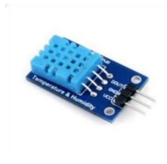
Fig. 4. DHT-11 Sensor

Empowering Smart Agriculture In Arunachal Pradesh Using Internet Of Things(IOT)