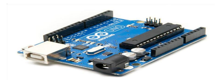
Fig. 3. Arduino UNO