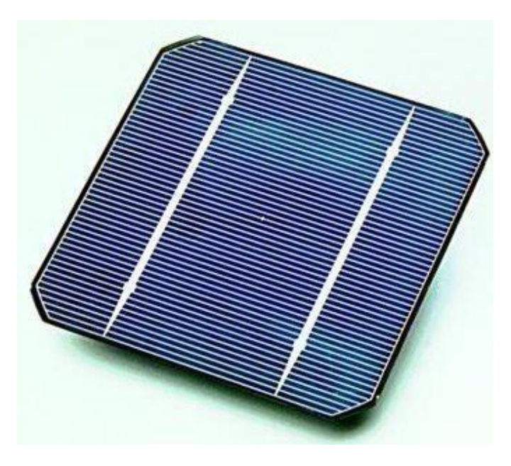
Fig. 5. Sunlight Sensor

vanced sunlight sensors can measure the spectral distribution of light, making it possible to differentiate between various light sources, including natural sunlight, fluorescent lighting, and LED lighting. Sunlight sensors can also be combined with other sensors like temperature and humidity sensors to provide a comprehensive view of environmental conditions.