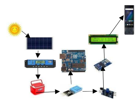
Fig.1 Solar Powered Smart Vaccination Refrigerator Management system