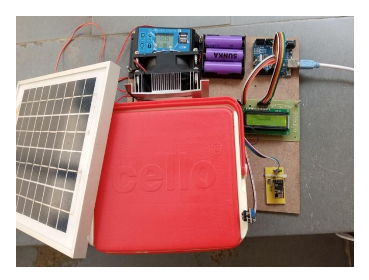
Fig.3 Expermental Setup with Welcome Message

In the fig.3, we have connected the power supply to the Arduino then it is showing WELCOME initially LCD will display a welcome message then after some time with the help of a Wi-Fi module and temperature sensor it will display the number of vaccines that remained in that refrigerator, and the temperature. We can see the temperature and the vaccine count on the mobile.