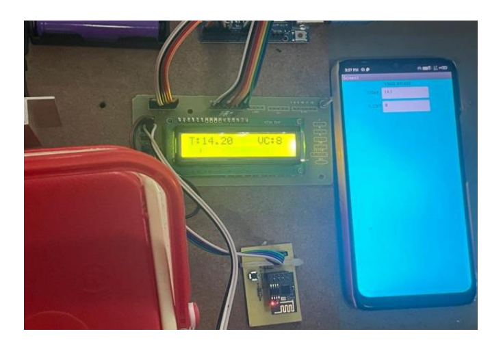
Fig.6 Temperature and vaccine count

The above fig.4, fig.5, fig 6 is the final hardware setup with temperature and vaccine count. The system could also be designed to provide real-time data on the status of the refrigeration unit, such as the current temperature and the amount of vaccine stock available. This information could be used to optimize vaccine distribution and ensure that vaccines are stored properly, which is critical for maintaining their efficiency.