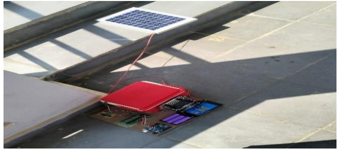
Fig.2 Expermental Setup

The above figure is the hardware setup. We have to place the solar panel directly to the sun so the solar charge controller shows the values through volts the maximum voltage of the solar charge controller lies between 16 to 20V. The minimum voltage of the solar charge controller is 0 to 10v and the refrigerator should be cover in the shadow because the IR sensor should not supposed to exposed to the heat energy of the sun.