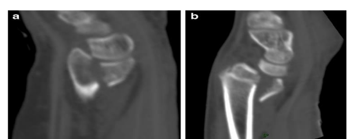
Fig. (3): Grading Barton fracture into 2 grades according to severity <sup>[10]</sup>.

and grade 2 is split-depression (Fig. 3), the volar portion of the joint is split and the remaining dorsal articular joint is depressed or comminuted [10].