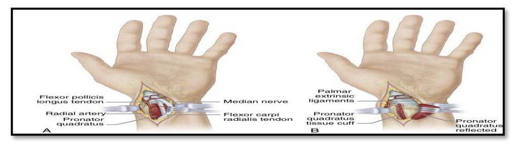
Fig. (4): Underneath the FCR sheath lies the flexor pollicis longus muscle this must be released and retrateed ulnarly<sup>[18]</sup>.

Volar surgical interval is in line with the flexor carpi radialis longus tendon between the radial neurovascular bundle and the median nerve (Fig. 4). The flexor pollicus longus (FPL) lies just deep to the flexor carpi radialis (FCR) sheath and is the first structure encountered in the deep interval. Retraction of the FPL ulnarly facilitates exposure of the distal radius (based on its origin from the anterior/ulnar aspect of the radial shaft and interosseous membrane in the forearm).. The pronator quadratus (PQ) overlies the distal radius. It has two heads. The superficial head attaches broadly over the radial aspect of the distal radius and is involved in initiation of pronation. The deep head is more oblique and attaches distally on the radius. The deep head acts as a stabilizer of the DRUJ and is less likely to be disrupted [18].