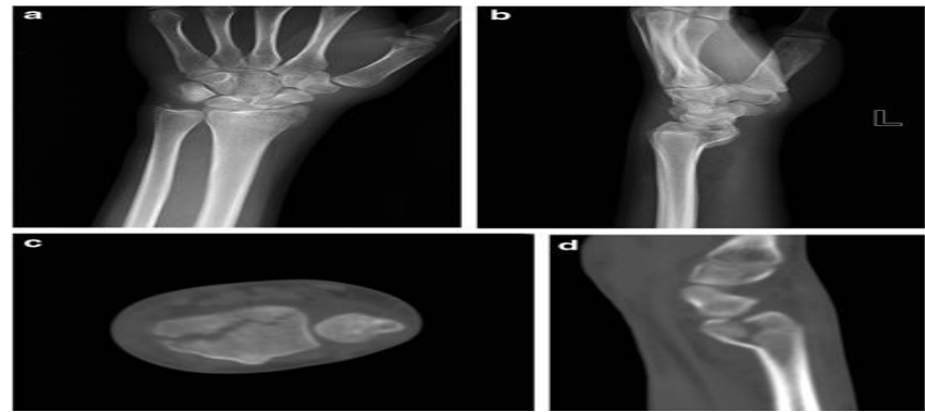
Fig. (2): Typical Volar Barton fractures <sup>[10]</sup>.

In typical Barton; a fracture line is hardly seen in anteroposterior wrist film, but overlap of the carpals and dorsal rim of distal radius can be observed (Fig. 2). In lateral film, volar fragment and step-off of radiocarpal joint is obvious. Sometimes a cortical fragment can be found in the