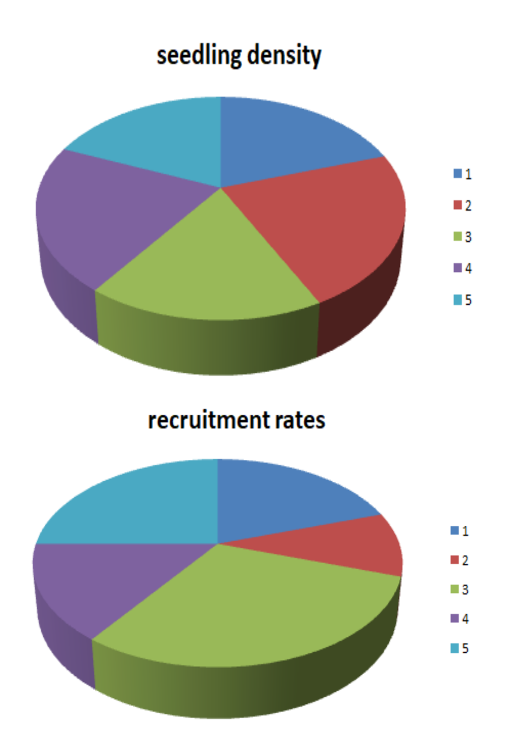
Fig 2 Pie chart for Field Survey % analysis