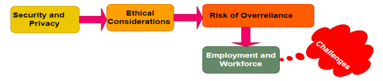
Fig 2 Application of Challenges and Concerns

The adoption of AI and digitalization in financial exchanges may have implications for the job market [14]. While automation can improve operational efficiency, it may also lead to job displacement. Upskilling and reskilling programs are essential to equip the workforce with the necessary skills to adapt to the changing technological landscape.