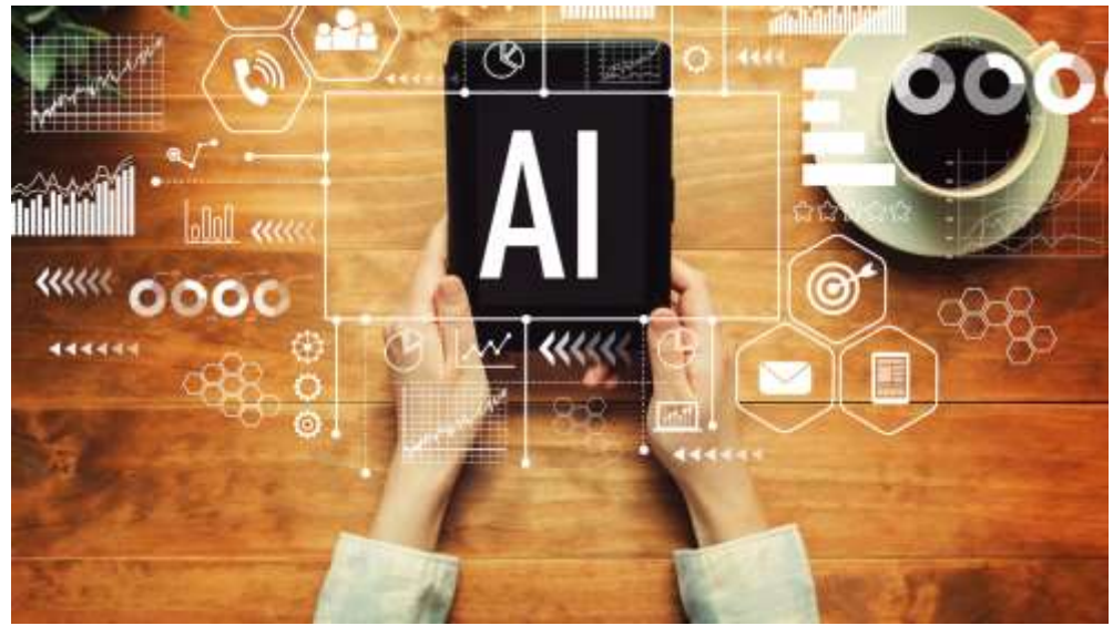
Figure 2 Data science and artificial intelligence's use and effects in change management [31]