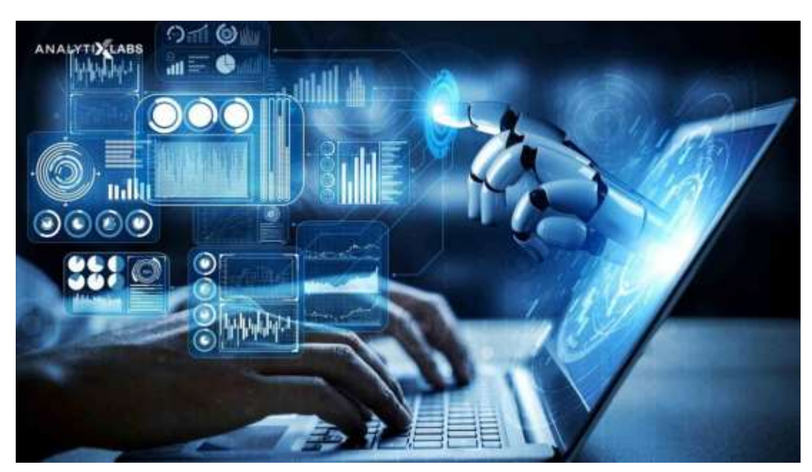
Figure 3 Artificial intelligence and data science trends [32]